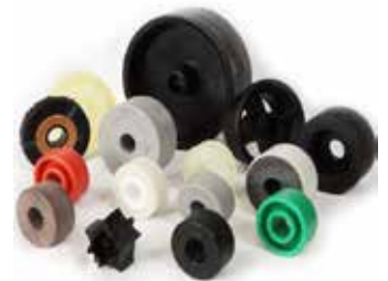
ROLLERS & BELTS