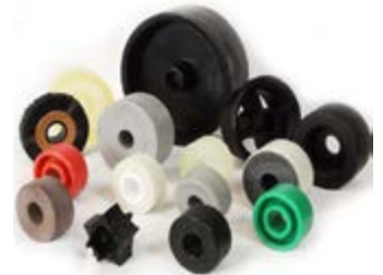
ROLLERS & BELTS